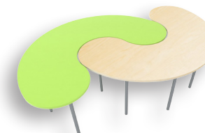
Apple Green and Maple options shown in linking configuration