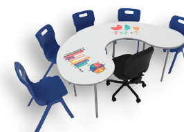
Buddy Whiteboard Moon Table Visit website for pricing options

View Buddy Moon Table online for pricing options